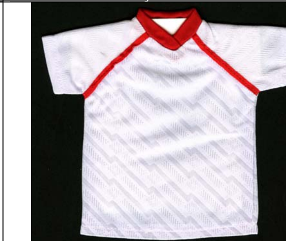
MTS-210 100% Polyester - shiny special