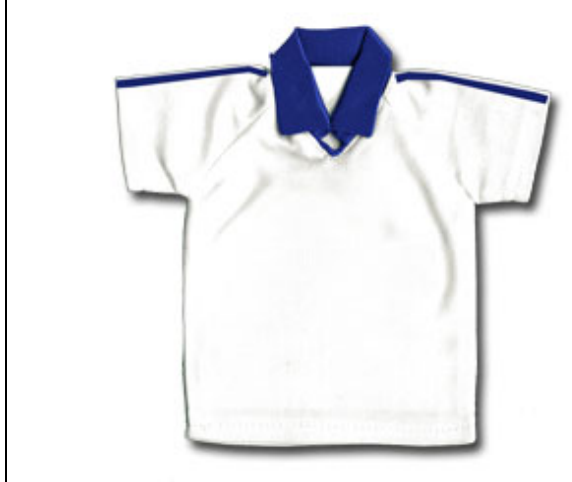
MTS2-209 100% Polyester – standard