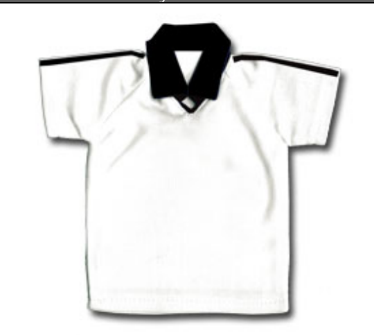
MTS2-209 100% Polyester – standard