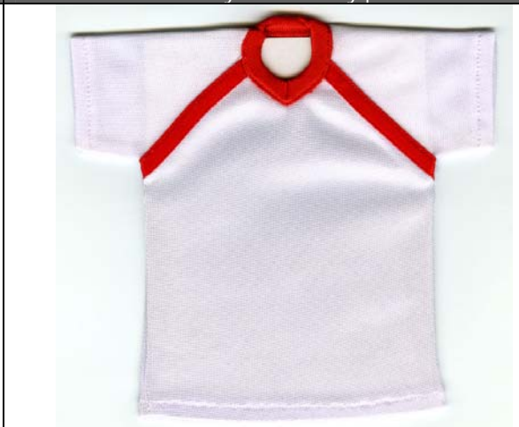
MTS2-210 100% Polyester – shiny pattern