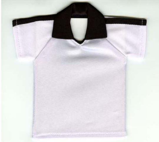
MTS2-209 100% Polyester – standard

a) standard b) shiny or c) shiny pattern