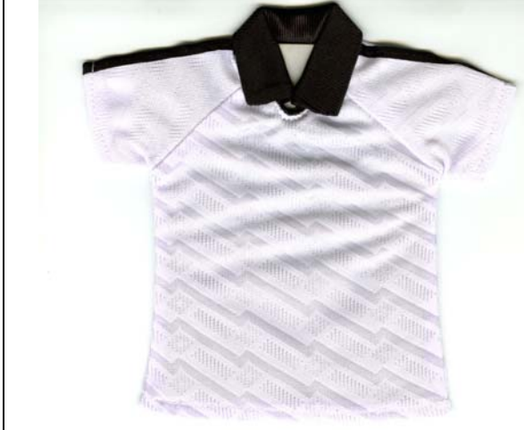
MTS2-209 100% Polyester – shiny pattern